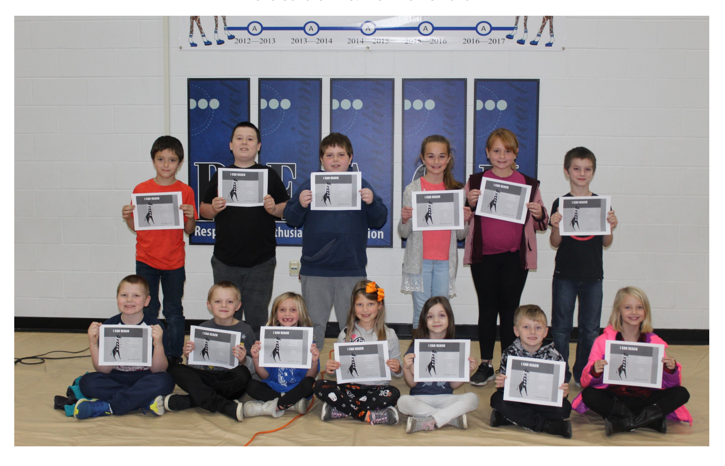
Ambition Reach Award