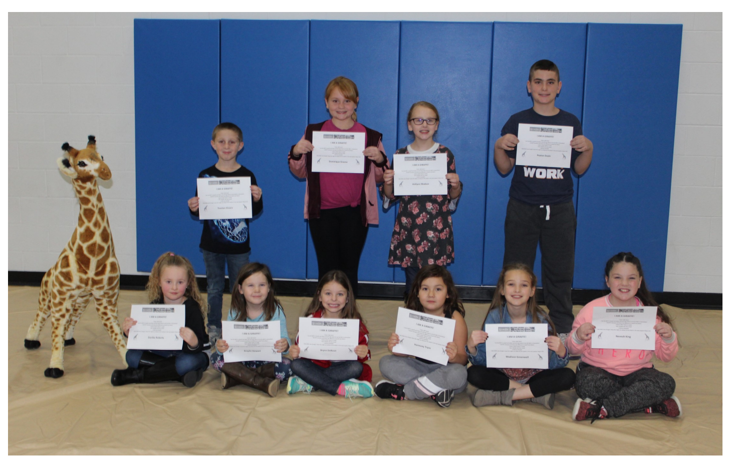
October Giraffe Club